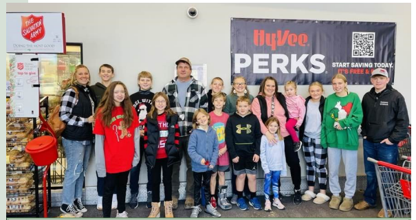
Thank you to everyone that came and helped! We love our St. Andrew's youth! What a great group of kids (and parents)...

One of the best things to do is ring the bell with our youth at St. Andrew's Lutheran Church. It was a great start to the holiday season. Love my church family!