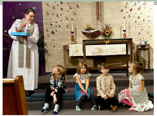
In Luke 18, Jesus invited the children. In Mark 10, Jesus embraced the children. Churches that welcome and embrace children are like Jesus.

One of the best things to do is ring the bell with our youth at St. Andrew's Lutheran Church. It was a great start to the holiday season. Love my church family!